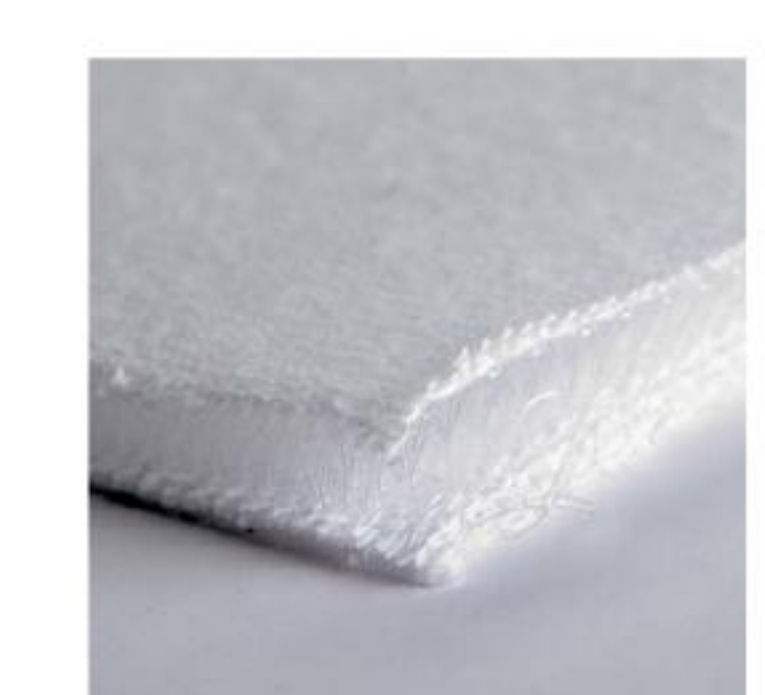
3D Air Comfort textile*